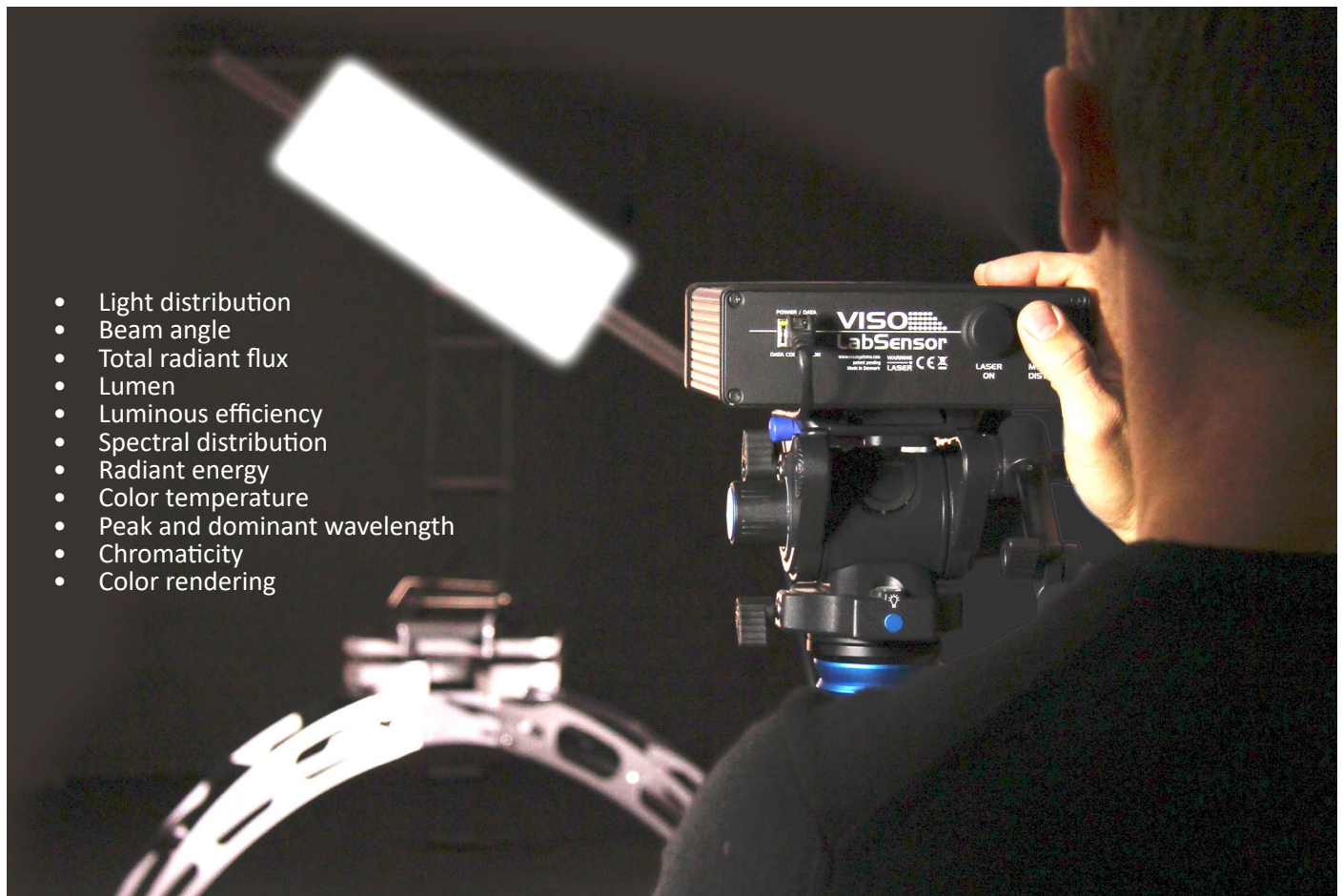
The 2-axis goniometer gives you a full 3D light distribution