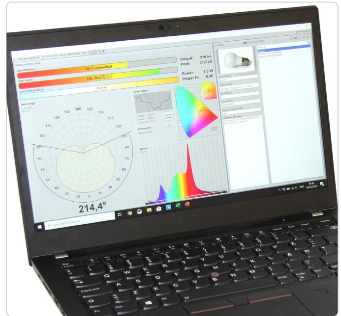
The Viso Light Inspector software is included. The software controls the fully automatic measuring process, all settings and outputs and your measurement library. User-friendly graphics and plenty of output options at your fingertip.

Measurement data is then automatically saved in a specific folder in the form of .fixture files. They are usually exported into PDF, PNG, IES, LDT and CSV formats. You can create your own custom pdf report templates.